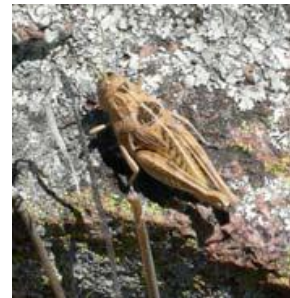
Figure 6: Perunga Grasshopper