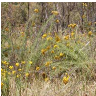
Figure 2: Clustered Everlasting