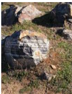
Figure 3: Hornfels