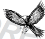
Namadgi National Park