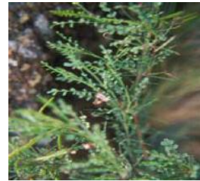
Figure 4: Tick Bush