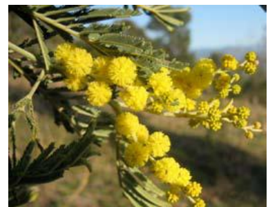
Figure 7: Silver Wattle