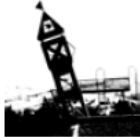
Town and District Parks