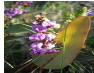
Figure 5: Native Sarsparilla