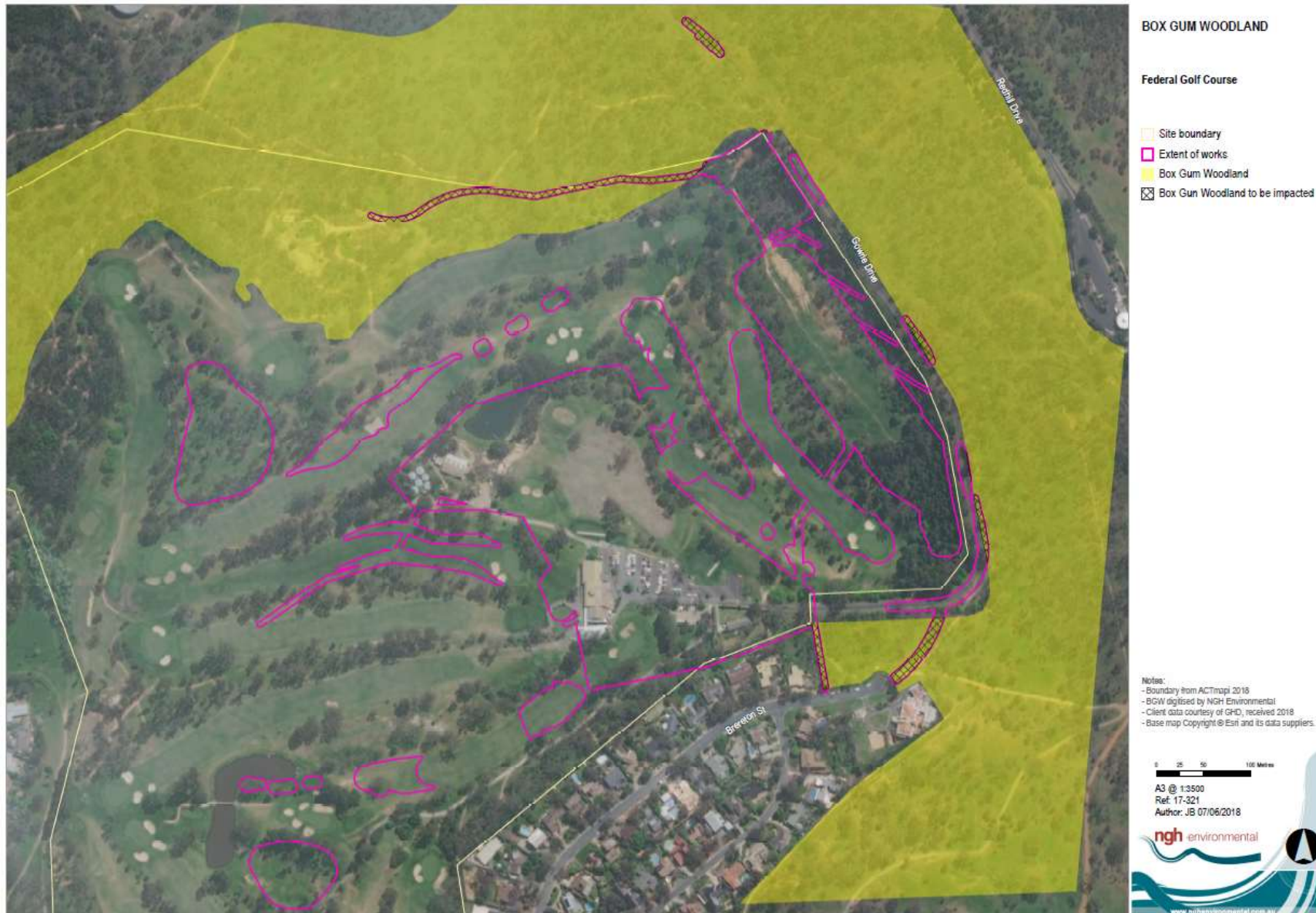
Figure 4 Extent of Box Gum Woodland TEC impacted by proposed works